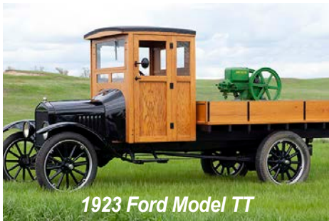
1923 Ford Model TT