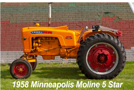
1958 Minneapolis Moline 5 Star