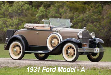
1931 Ford Model - A