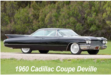
1960 Cadillac Coupe Deville