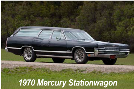
1970 Mercury Stationwagon