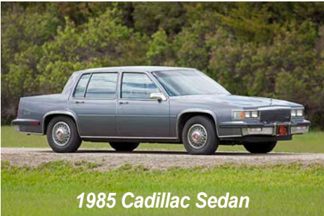
1985 Cadillac Sedan