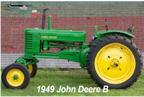
1949 John Deere B