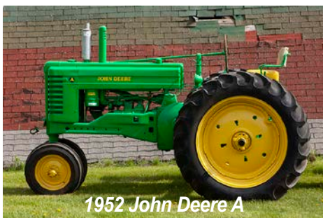
1952 John Deere A