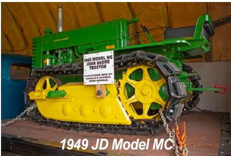
1949 JD Model MC