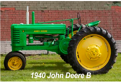
1940 John Deere B