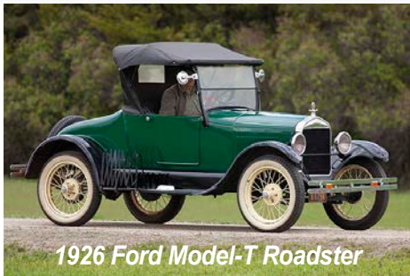
1926 Ford Model-T Roadster

For more info or to view this collection contact: Beth at 605-848-1492 or Weishaar Auction Service 701-872-5299 / 701-876-9023