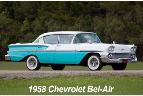
1958 Chevrolet Bel-Air