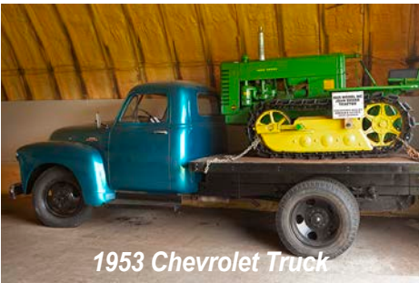
1953 Chevrolet Truck