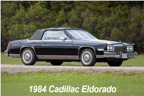
1984 Cadillac Eldorado