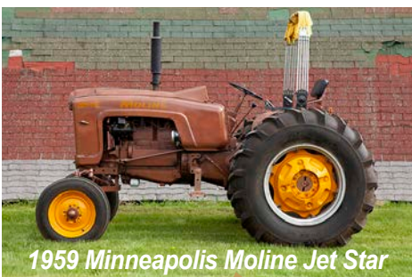
1959 Minneapolis Moline Jet Star

For more photos and sale information, visit weishaarauctions.com