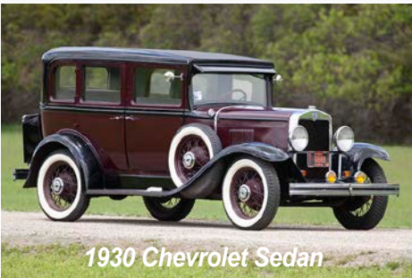
1930 Chevrolet Sedan