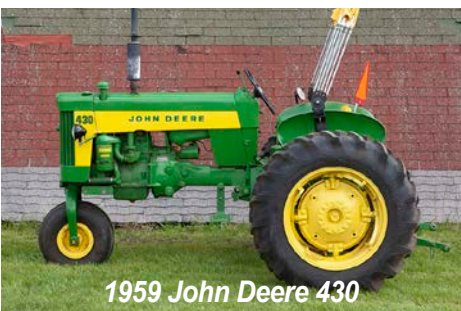
1959 John Deere 430