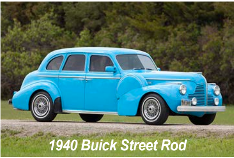
1940 Buick Street Rod