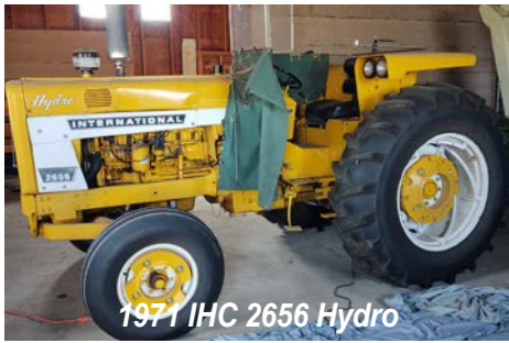
1971 IHC 2656 Hydro