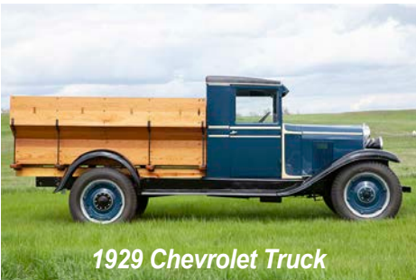
1929 Chevrolet Truck